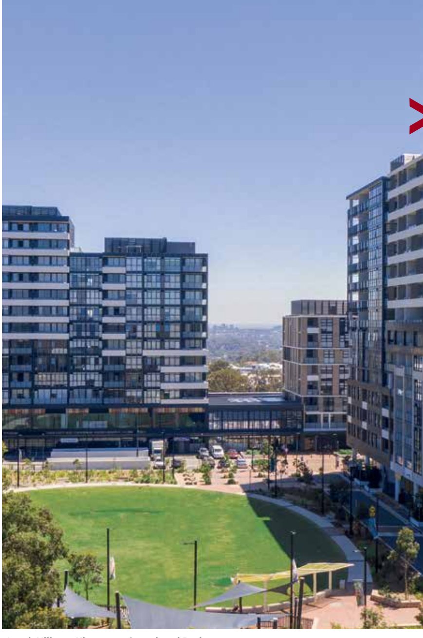
An Enviable Track Record