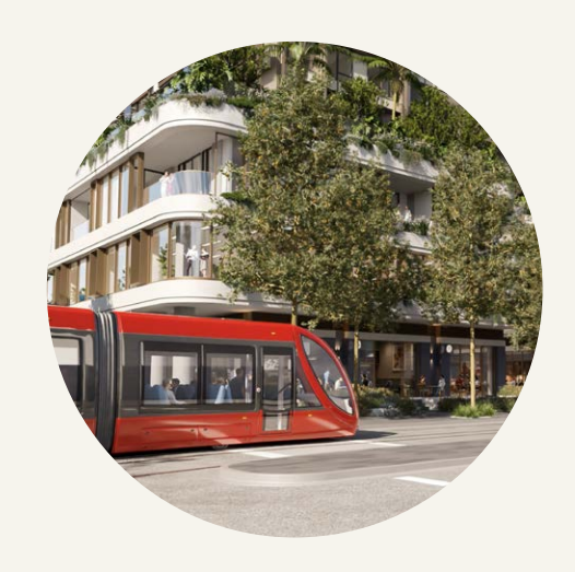
NEW PARRAMATTA LIGHT RAIL

Take time out for a gym session, do your grocery shop, and visit the doctor right where you live. A planned fitness centre, medical practice, Coles supermarket and other commercial tenancies promise a true live, shop, play hub.