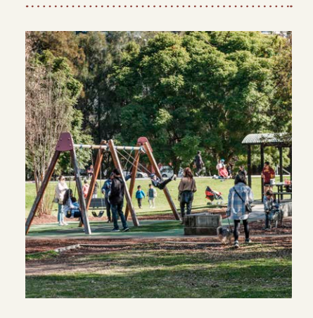
PLAYGROUND & WATER PARK

Keep the kids amused at James Ruse Reserve's playground and waterpark. With its swings, water fountains, jets and sprinklers, it's a great way to cool off in summer.