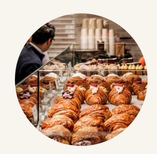
RETAIL PRECINCT & LANEWAYS

Nestled alongside James Ruse and Robin Thomas Reserves, Cosmopolitan is an urban sanctuary, designed with lush greenery, peaceful garden pavilions, dining and seating spaces for entertaining with family and friends.