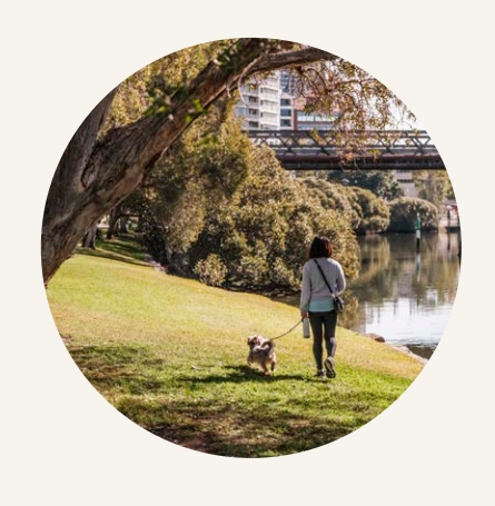
ON YOUR DOORSTEP AT COSMOPOLITAN