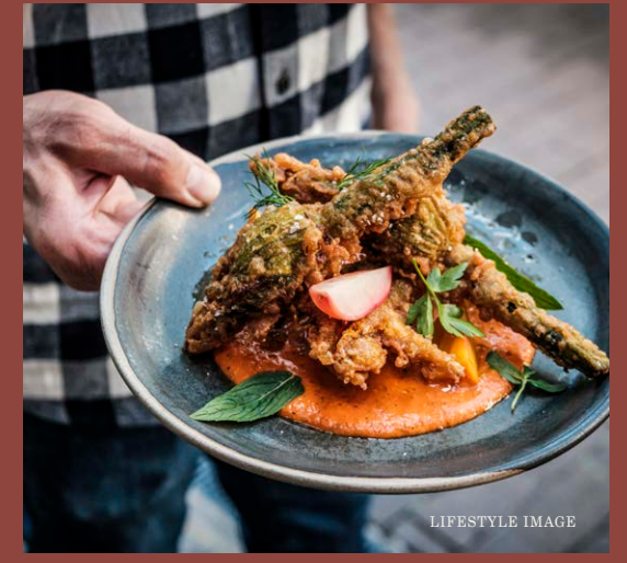
THE BEST OF CITY CONVENIENCE ON YOUR DOORSTEP

All the things you'll love are just a lift ride away. Alfresco laneway coffee bars and eateries offer an inviting café and dining scene, shop for daily essentials and stock your pantry downstairs at your local supermarket, while Cosmopolitan's onsite commercial gymnasium helps you look good and feel great year-round.