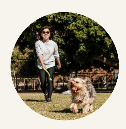
PARKSIDE LIVING & GREEN SPACES

There's something for everyone in Cosmopolitan's choice of beautifully designed one, two and three-bedroom apartments. With views over the CBD, river and neighbouring parklands, you and your family can enjoy the best of river city life.